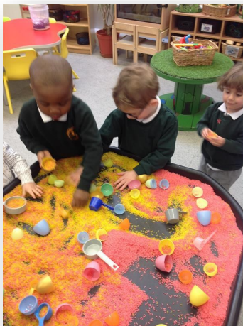
Children from Opal Class have been having some Easter fun with colourful eggs. They had to find the correct sized and colour egg to make it a 'whole' and count how many scoops of rice it took to fill the centre.