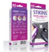
Stikins Write On, Peel Off, Stick In! £11.50