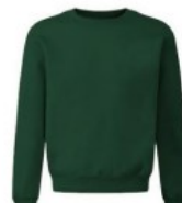
Bottle Sweatshirt Plain Green From £10.95