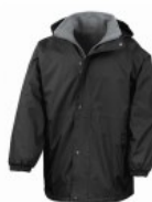
Black StormDri Jacket Waterproof From £26.00