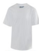
White PE T-Shirt Reception - Year 6 From £4.50