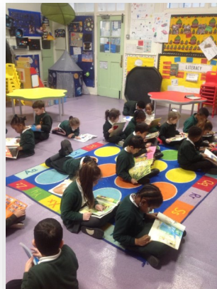
Ruby Class preparing for World Book day with silent reading!