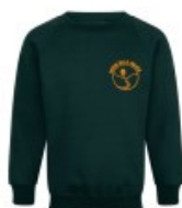
Bush Hill Park Sweatshirt 40% Recycled Fabric From £12.50