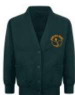
Bush Hill Park Cardigan 40% Recycled Fabric From £13.50