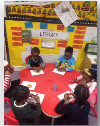
Reception children making characters on biscuits for World Book Day