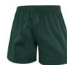
Bottle Cotton Shorts Plain Bottle £6.50