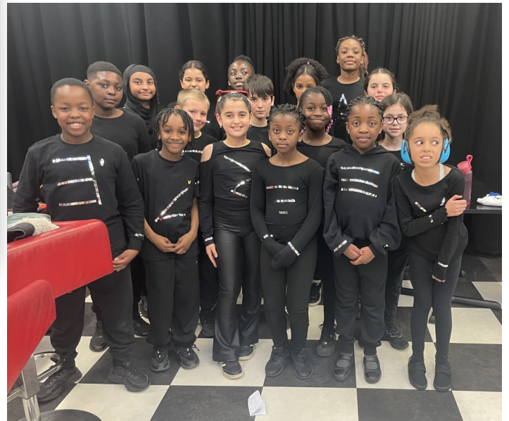
Well done to our performers whose dance was OUTSTANDING at this year's Enfield Schools Dance Festival ...you were all amazing!