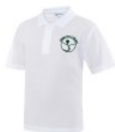
Bush Hill Park Polo Shirt Easy-Iron From £7.95