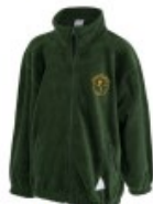
Bush Hill Park Fleece Fleeced Outerwear £16.00